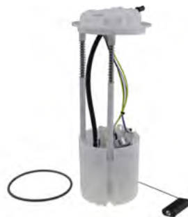
Fuel Supply Systems