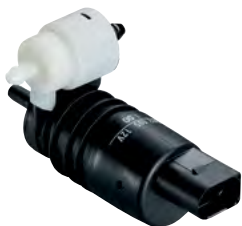
Windshield and Headlight Cleaning Systems